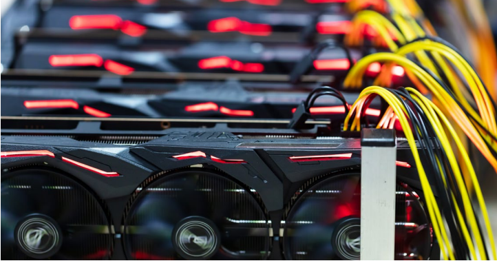
GPU and platform right-sizing recommendations for an AI software company.