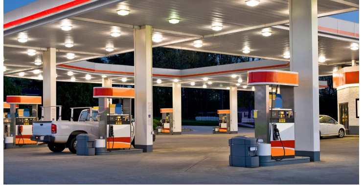
Ground-up display and compute design for a retail environment.