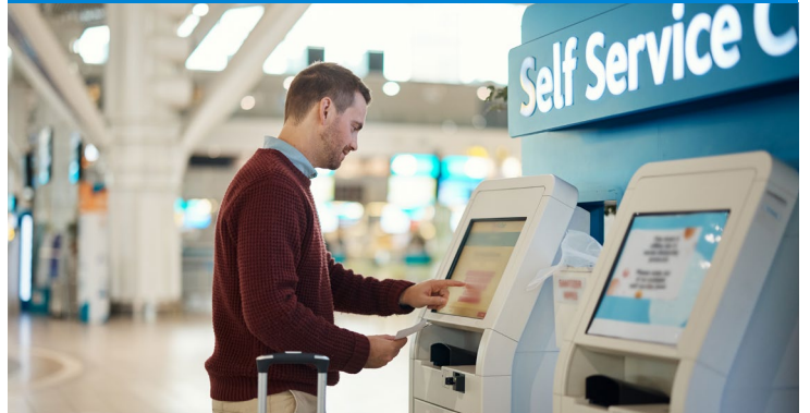
Custom image development with improved security, reliability, and customer experiences.