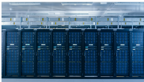
Data Center Services