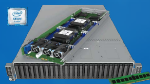
Figure: Intel® DCB Portfolio - Server building blocks for specific segments with pre-configured and configure-to-order options

To offer a new level of consistent pervasive and breakthrough performance, Intel's Data Center Blocks have Intel® Xeon® Scalable Processors at their core and deploy widely expanded resources for hardware acceleration and integration. Rapid deployment and minimal complexity are achieved using Intel® Xeon® based Virtual Machines (VM) which coexist with other server infrastructure and deliver full compatibility. In addition, the server blocks meet stringent response time criteria set by highly demanding applications like high-speed trading and real-time analysis. Since the processor cores, cache, and I/O are all part of a single die, the blocks deliver highly deterministic storage response. Moreover, the hardware acceleration features deliver diverse services at incredible efficiency.