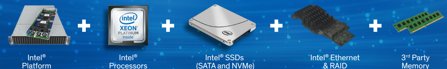
Figure: Intel® Data Center Blocks - Available as a pre-built system with a single order code

Intel's philosophy towards building the next-generation data center infrastructure is guided by a mission to deliver breakthrough innovation and differentiation by integrating Intel's data-centric portfolio in unique ways to create higher customer value. Starting with the processor, systems, and components to comprehensive workload-optimized solutions, Intel® Data Center Blocks bring interoperability, scalability, and agility to help modernize the data center while implementing the highest standards of security and business model flexibility.